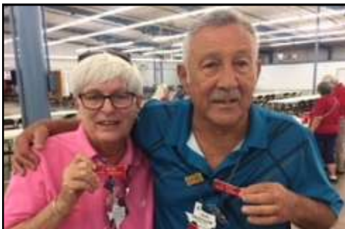
Sports-man-ship Noun Fair and generous behavior or treatment of others, especially in a sports contest. HINT, badge saying "I Won And You Didn't" does not qualify.