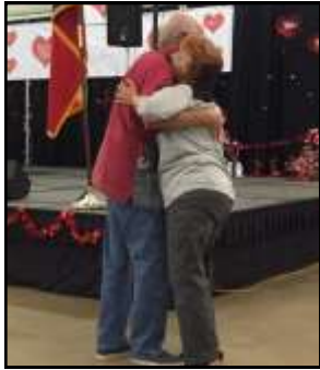
One of the many dancing duos that enjoyed the music