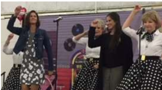
The Rhines Daughter-In-Law & Granddaughter...they never saw it coming. LOL!